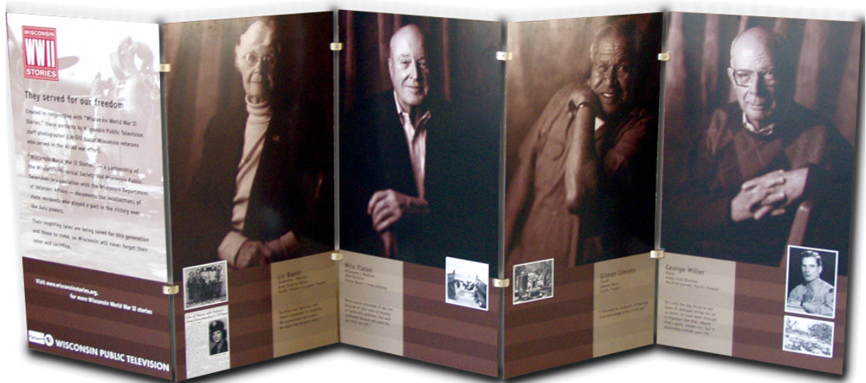
table-top portrait exhibit - 10' x 3.5'